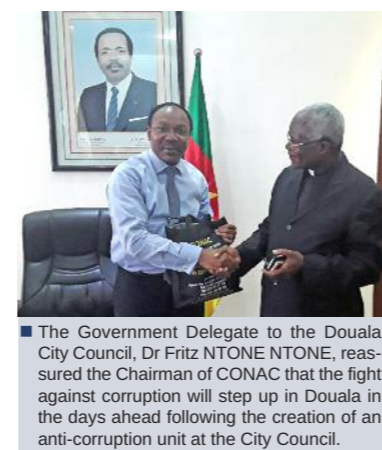
The Government Delegate to the Douala City Council, Dr Fritz NTONÉ NTONÉ, reassured the Chairman of CONAC that the fight against corruption will step up in Douala in the days ahead following the creation of an anti-corruption unit at the City Council.