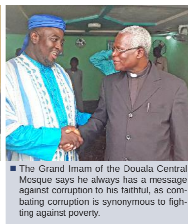
The Grand Imam of the Douala Central Mosque says he always has a message against corruption to his faithful, as combating corruption is synonymous to fighting against poverty.